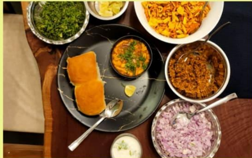
Snacks & More